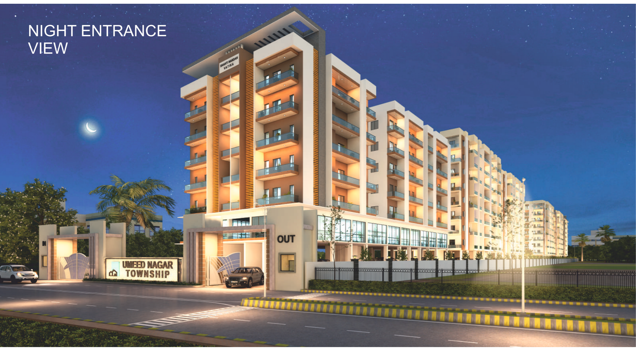
NIGHT ENTRANCE VIEW