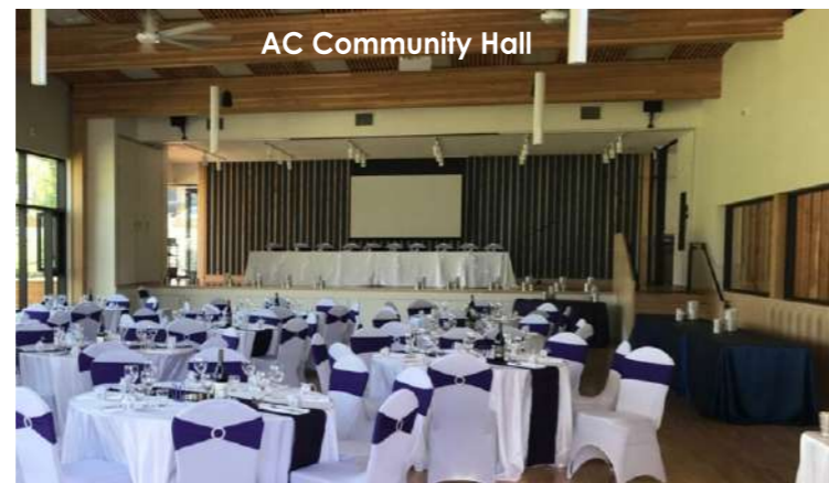
AC Community Hall

• STRUCTURE R.C.C. Framed structure with Earthquake resistance.